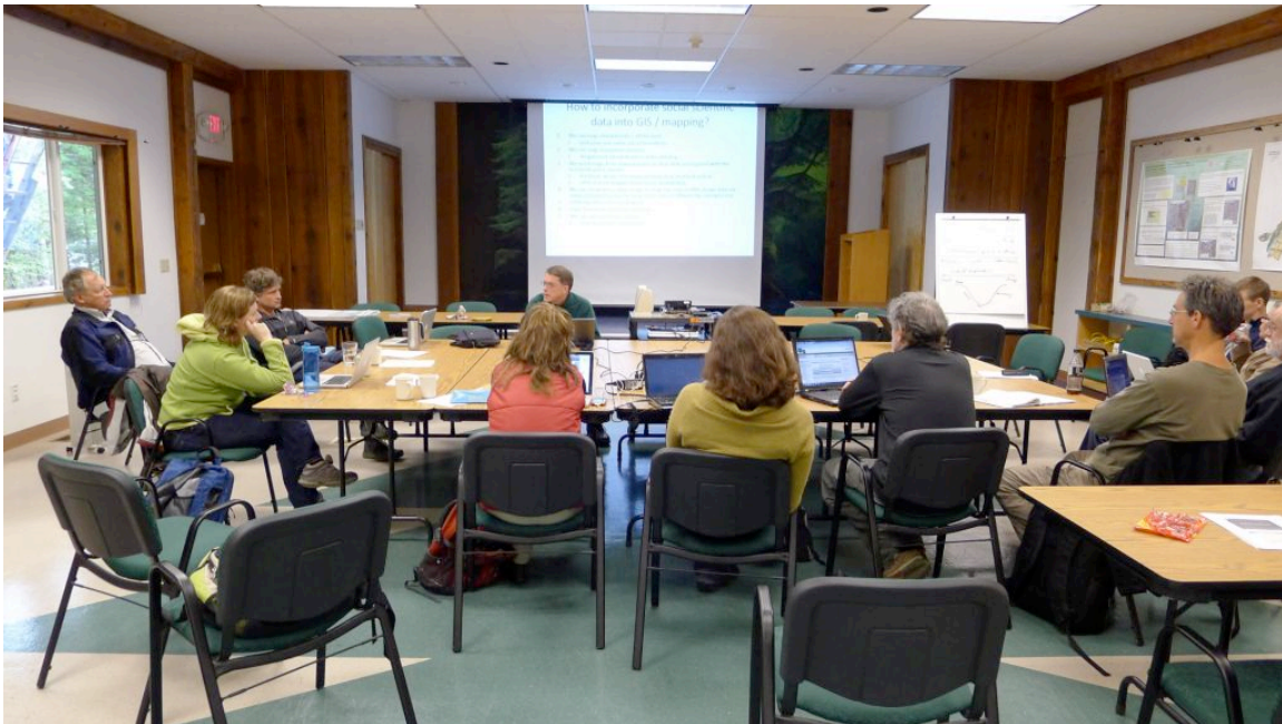
MALS workshop participants meeting in the HJ Andrews Experimental Forest conference facility.

The ensuing discussion produced an outline for moving forward with MALS research. Please see Appendix 3 for this outline.