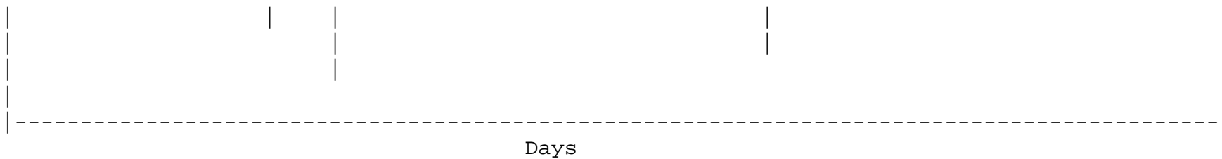
Fig. Y. Examples of data collections which are sufficiently extensive to smooth out small-scale variations and form a suitable series for long-term studies.

A second specific recommendation of our group is that, at Georges Bank or similar sites where comparatively high-quality, long-term data on fish production and population structure exist, a long-term study be undertaken to measure species structure and distribution at the primary and secondary trophic levels. More precisely, this would involve, in light of present technology, continuous or semi-continuous underwater measurements of phytoplankton fluorescence and both phytoplankton and zooplankton size distributions (by particle counter methods). This would be augmented by the usual oceanographic measurements (e.g., temperature, salinity, light intensity, nutrients by auto analyzer, etc.). In addition, these techniques should be regularly calibrated for size and species composition by comparison with direct counts from samples.